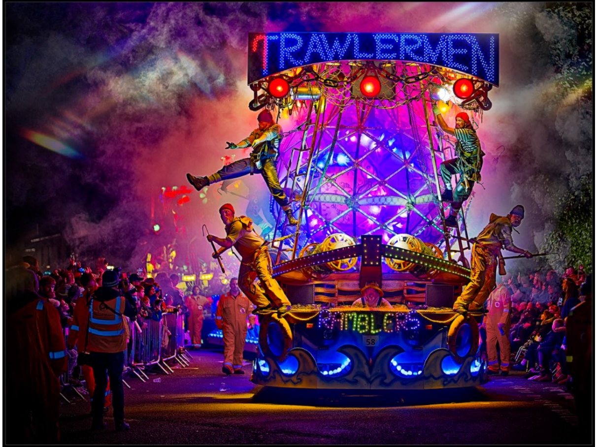
Bridgwater Carnival see inside for details