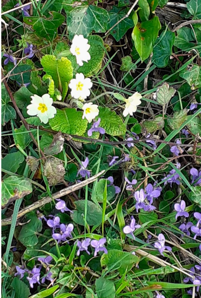
Spring flowers in Benhole Lane