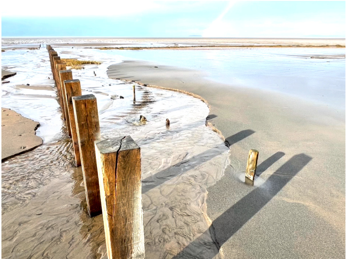
Steppholm from Steart - Part of After:Image 29th April to 25th May Taunton CICIC