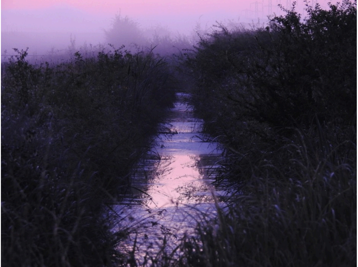
Steart Marshes at Sunrise