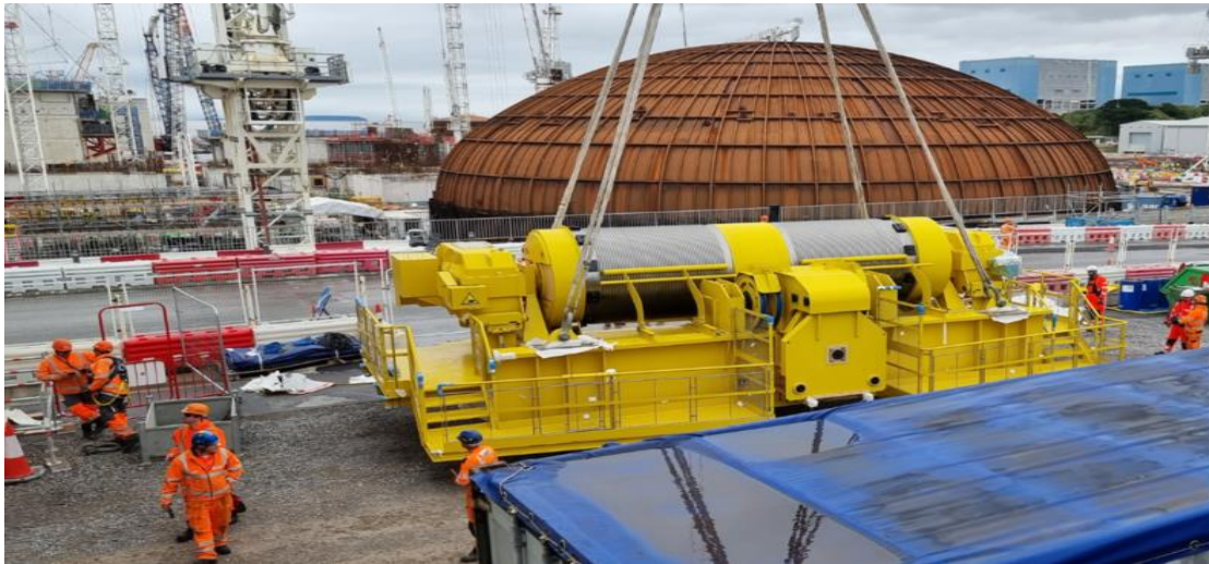
The trolley prior to being lifted

The installation of the reactor buildings polar crane is an example of a key piece of work on the path to dome lifting as it needs to be installed before it takes place. This month the assembly of the Polar Crane moved closer to completion.