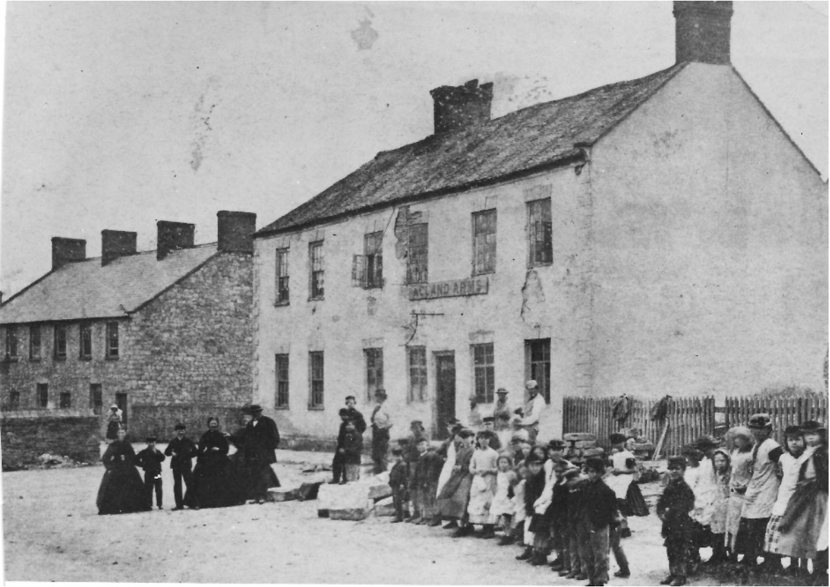
The Acland Arms Date and photographer unknown