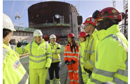
Boris Johnson meets apprentices outside reactor Unit 1 at Hinkley Point C