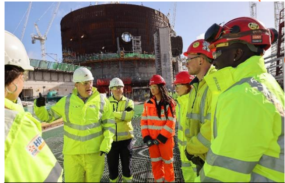
Boris Johnson meets apprentices outside reactor Unit 1 at Hinkley Point C

The strategy sees a major emphasis on homegrown power for greater energy independence with a significant acceleration in nuclear generation and an ambition of up to 24GW by 2050. A new government body, Great British Nuclear, will be set up immediately to bring forward new projects.