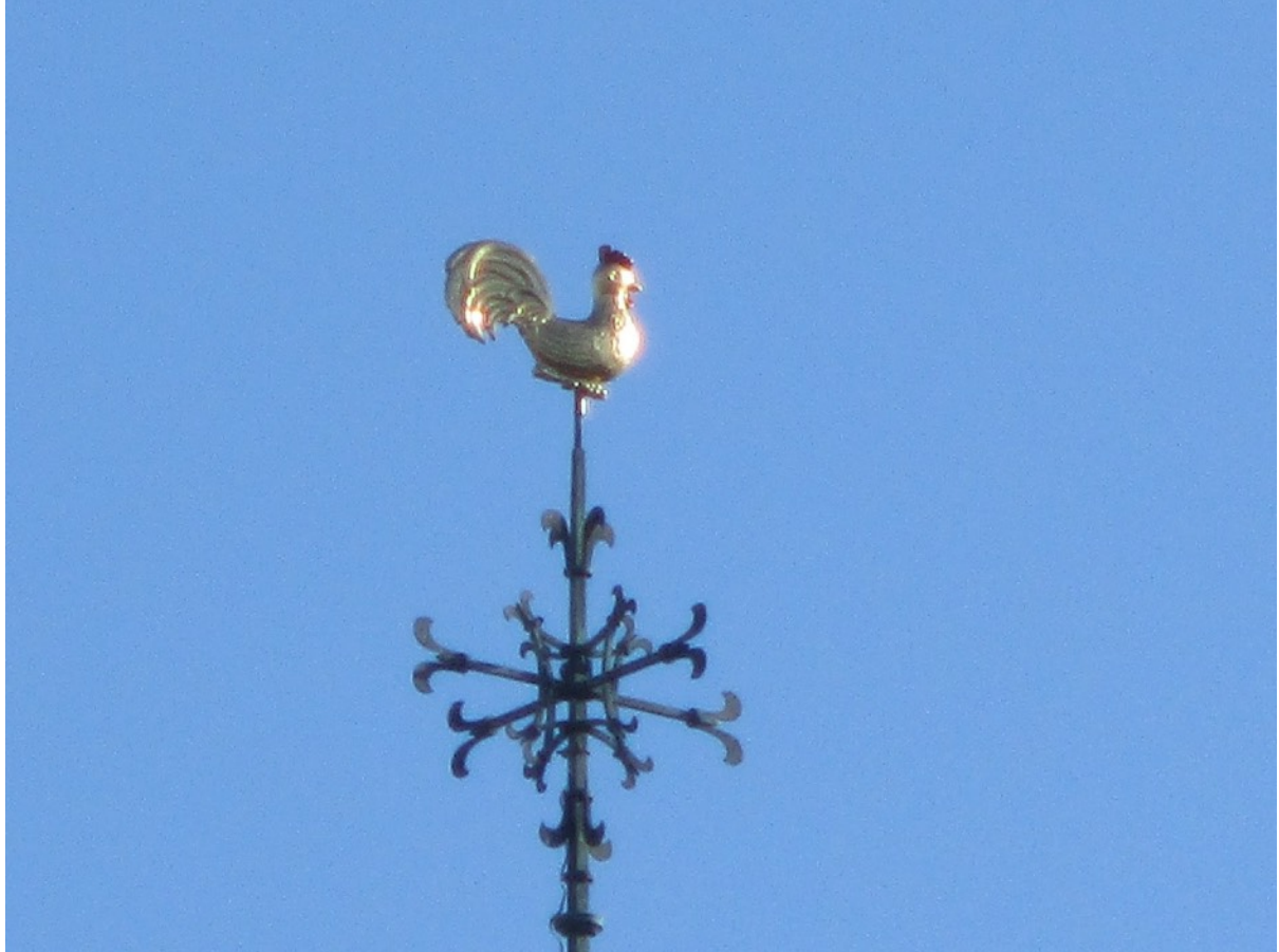
Newly Regilded Weathercock