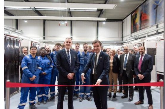
Energy Minister Greg Hands opening the new Welding Centre of Excellence at Bridgwater and Taunton College

Many trainees live in the surrounding area and will take advantage of the 4,000 jobs being created for Hinkley Point C's next phase, which will see miles of pipes and electrical cables being fitted across the power station.