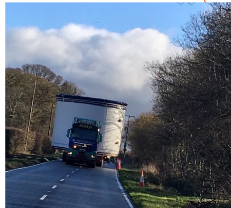
Tunnel Boring Machine travelling up the C182 in 2018

https://www.surveymonkey.co.uk/r/XQY9VDP