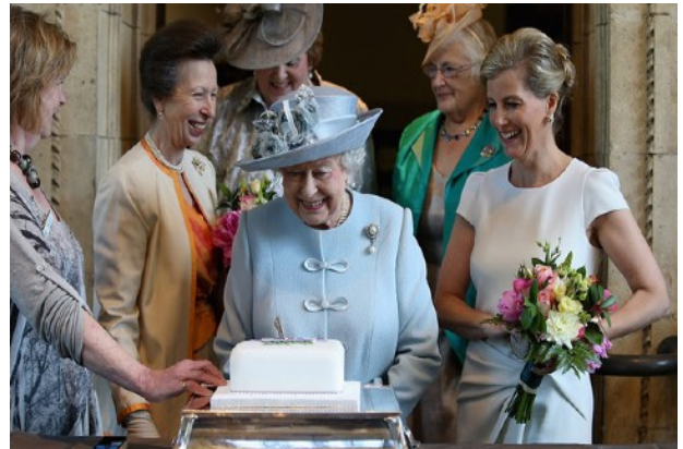
Queen Elizabeth cutting the WI centenary cake at the WI annual meeting.