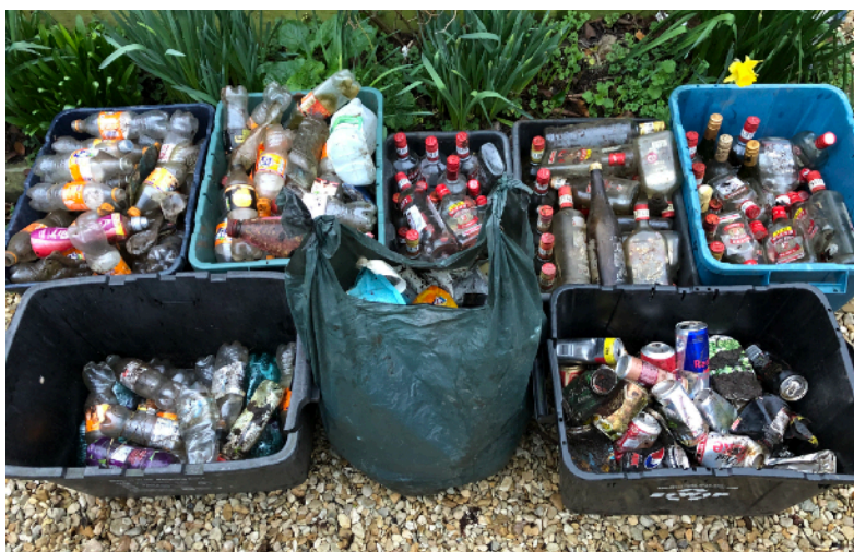
A short lockdown litter pick in Stolford from Priors Cottage to Bavview Farm. James Brereton