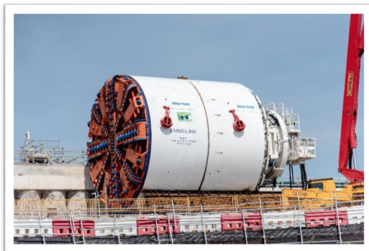
Emmeline the Tunnel Boring Machine