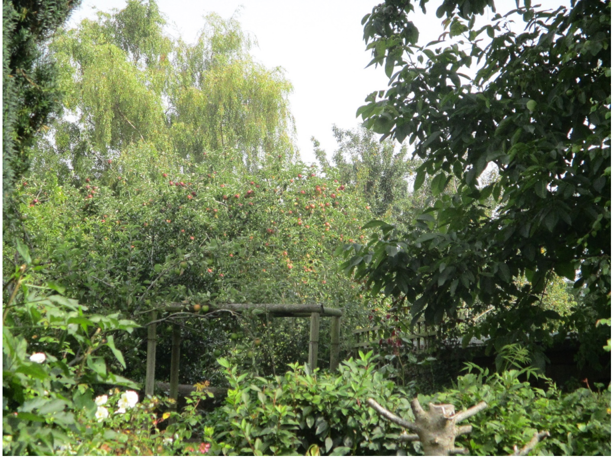
Seasonal Fruits: Plums in a Stogursey Garden