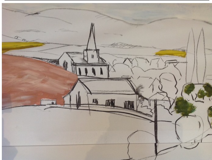
Work in progress - from the Art Festival's mural in the church