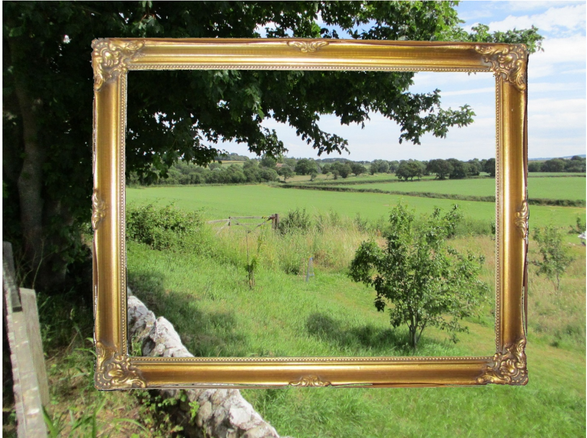
View across the Glebe land